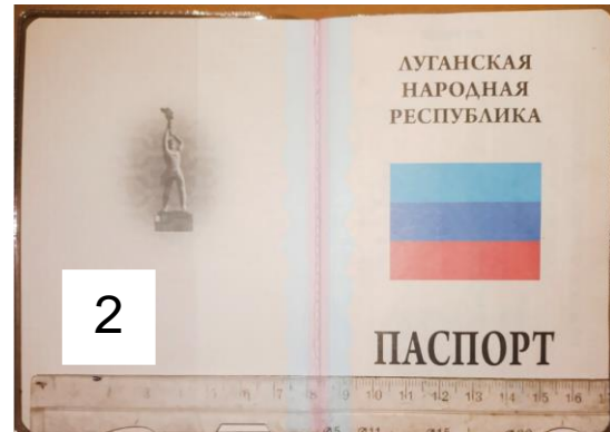
Figure 1,2. The sample of the passport of so-called LPR