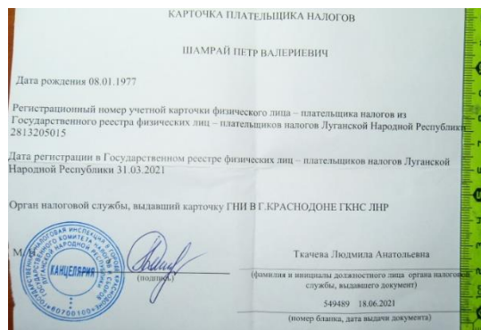
Figure 3. The sample of the taxpayer card of so-called LPR

We have to stress that having received the so-called passport of a citizen of the LPR, its owner cannot use it for international travel to European countries and the United States, because the so-called Luhansk People's Republic is only the temporary occupied territory of Ukraine (Oformlenie i poluchenie). Currently, for internal use, the passport of the Luhansk