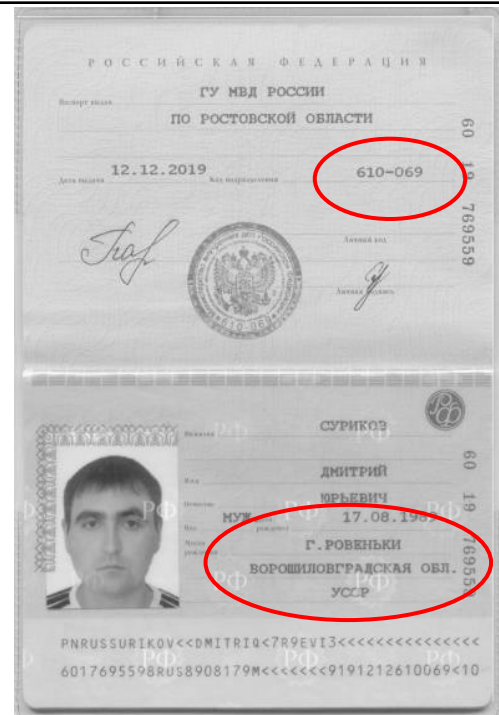
Sample passport of the RF issued to citizens of the so-called LPR with the corresponding identifiers

Summarizing all mentioned above, it can be noted that a person living in the TOT of Luhansk region on the basis of a passport of Ukraine, can get a passport of the so-called LPR, get married, change his name and get a Russian passport with her new husband's name (as example).